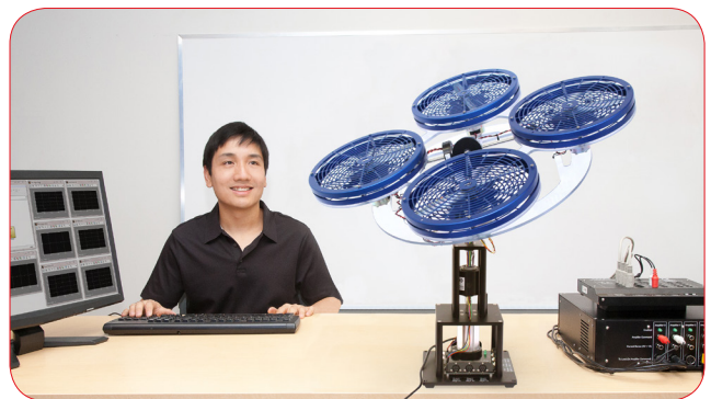
3 DOF Hover workstation