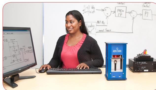
Magnetic Levitation workstation