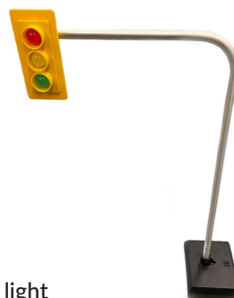
Smart Traffic light